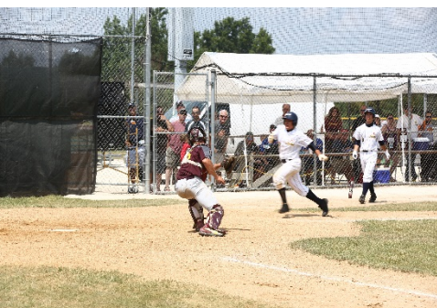
Some photos copyright RFP Photography Inc.